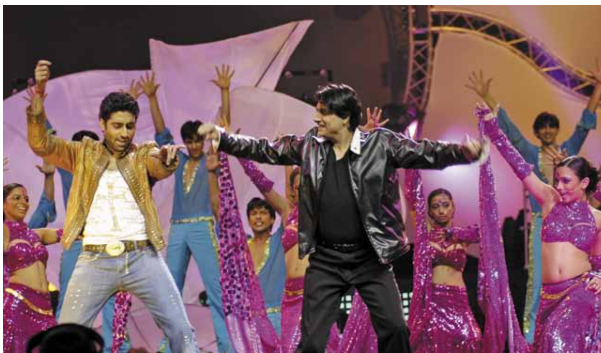
Abhishek Bachchan, left, dances with Shiamak Davar at a past IIFA.

Selcouth is my new dance production. It in fact started off as a graduation show for my One Year dance certification program. I have been choreographing these shows for years for students and parents at my dance school, but when people saw Selcouth they said I must open it for public. I’ve developed this style of choreography over years and expresses who I am... it is very indo contemporary and