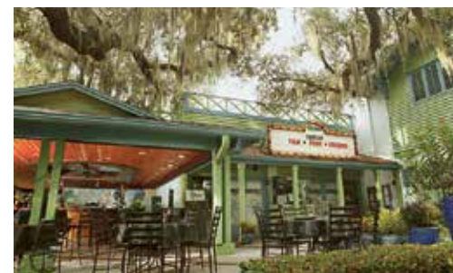
Enzian Theater in Maitland.